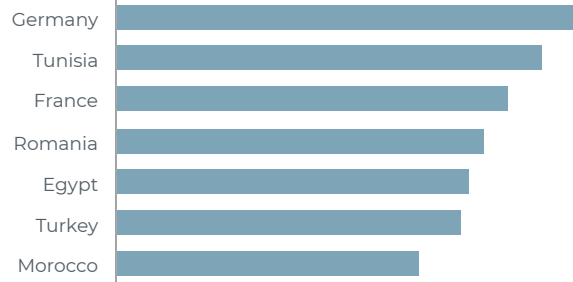
Quality of sector-specific experienced staff